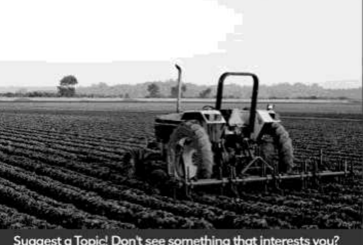
Suggest a Topic! Don't see something that interests you? Email us your class idea!

301-387-3064 | sarah.friend@garrettcollege.edu